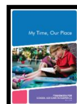
My Time, Our Place; Framework for School Age Care in Australia 2022 V2

Critical reflection: is a meaning-making process that assists informing future practice in ways that demonstrate an understanding of each child’s learning, development and wellbeing and implications for equity and social justice. It involves examining and analysing events, experiences and practices from a range of perspectives to inform future planning and decision-making ( Early Years Learning Framework 2022 V2 ).