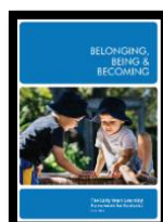
The Early Years Learning Framework 2022 V2 (Belonging, Being & Becoming)